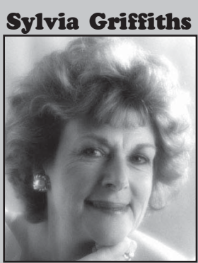
Musical Director (Choir Master & Show Conductor)