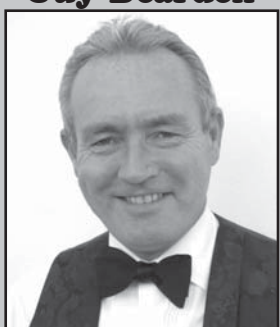
Musical Director (Orchestrations)